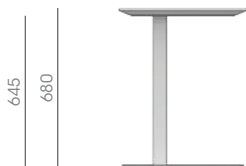
Anchor 01 (Front View)