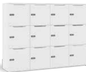
3 Tier Compartment