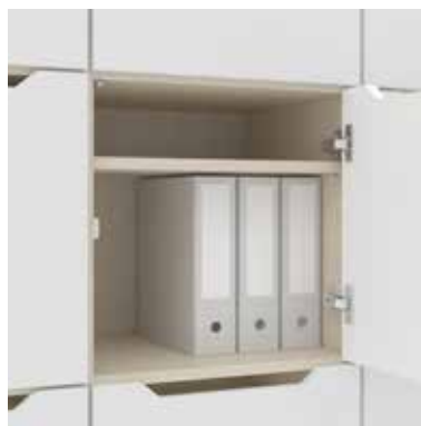
Shelving improves organization