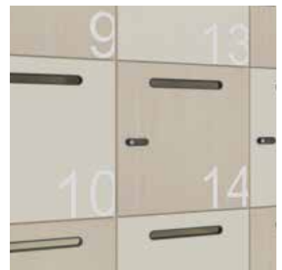
Customize Numbering Sticker (Optional)