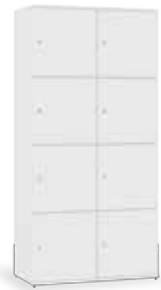
4 Tier Compartment