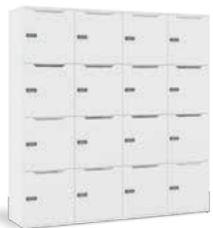
4 Tier Compartment