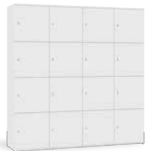
4 Tier Compartment