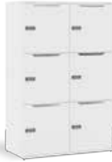
3 Tier Compartment