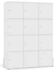
4 Tier Compartment