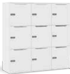
3 Tier Compartment