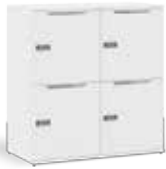
2 Tier Compartment