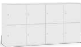
2 Tier Compartment