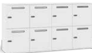
2 Tier Compartment