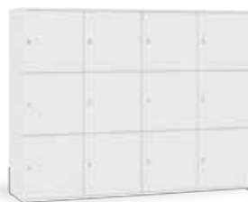
3 Tier Compartment