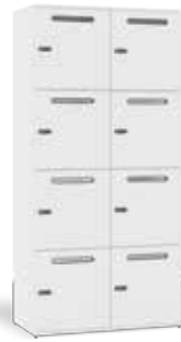
4 Tier Compartment