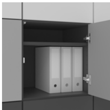
Shelving improves organization