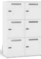
3 Tier Compartment