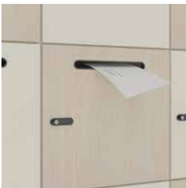
Pigeon hole door (Optional Push-Open)