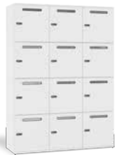
4 Tier Compartment