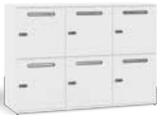
2 Tier Compartment