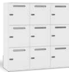
3 Tier Compartment