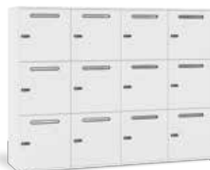
3 Tier Compartment