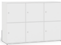
2 Tier Compartment