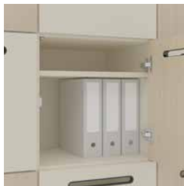
Shelving improves organization