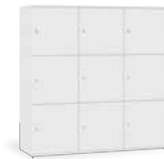
3 Tier Compartment