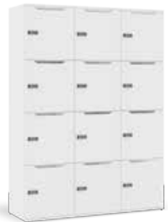
4 Tier Compartment