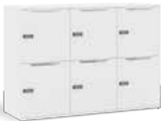
2 Tier Compartment