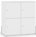
2 Tier Compartment