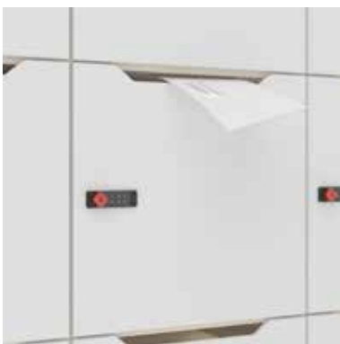
Wave shape door (Optional Push-Open)