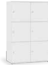
3 Tier Compartment