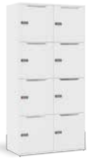
4 Tier Compartment