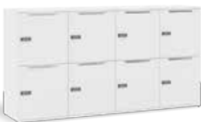
2 Tier Compartment