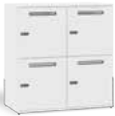
2 Tier Compartment