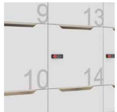
Customize Numbering Sticker (Optional)