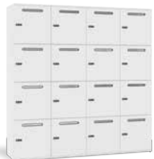
4 Tier Compartment